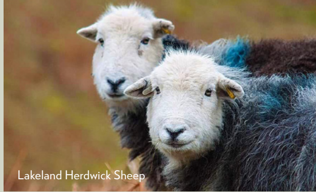
Lakeland Herdwick Sheep

Our driver guides are what make Mountain Goat tours so special, they will go above and beyond to help you make memories you will cherish forever.