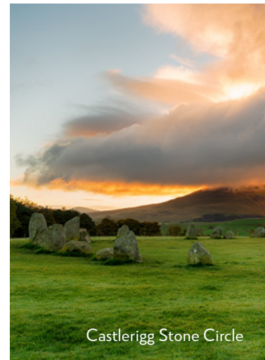
Castlerigg Stone Circle